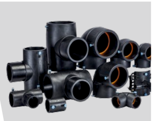
ELECTRO FUSION & SPIGOT FITTINGS